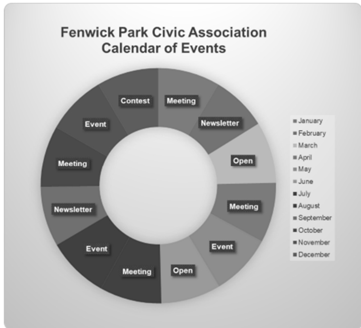
FPCA Calendar of Events