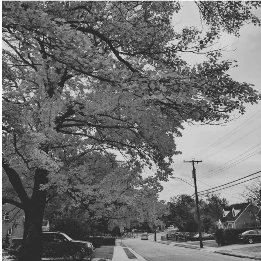
Fall on Rogers Drive

Special recognitions to community members, events, and other efforts